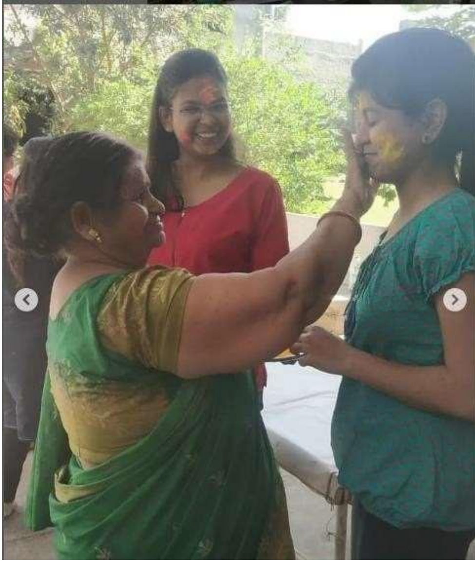
Glimpses of Narayan Old Age Home visit