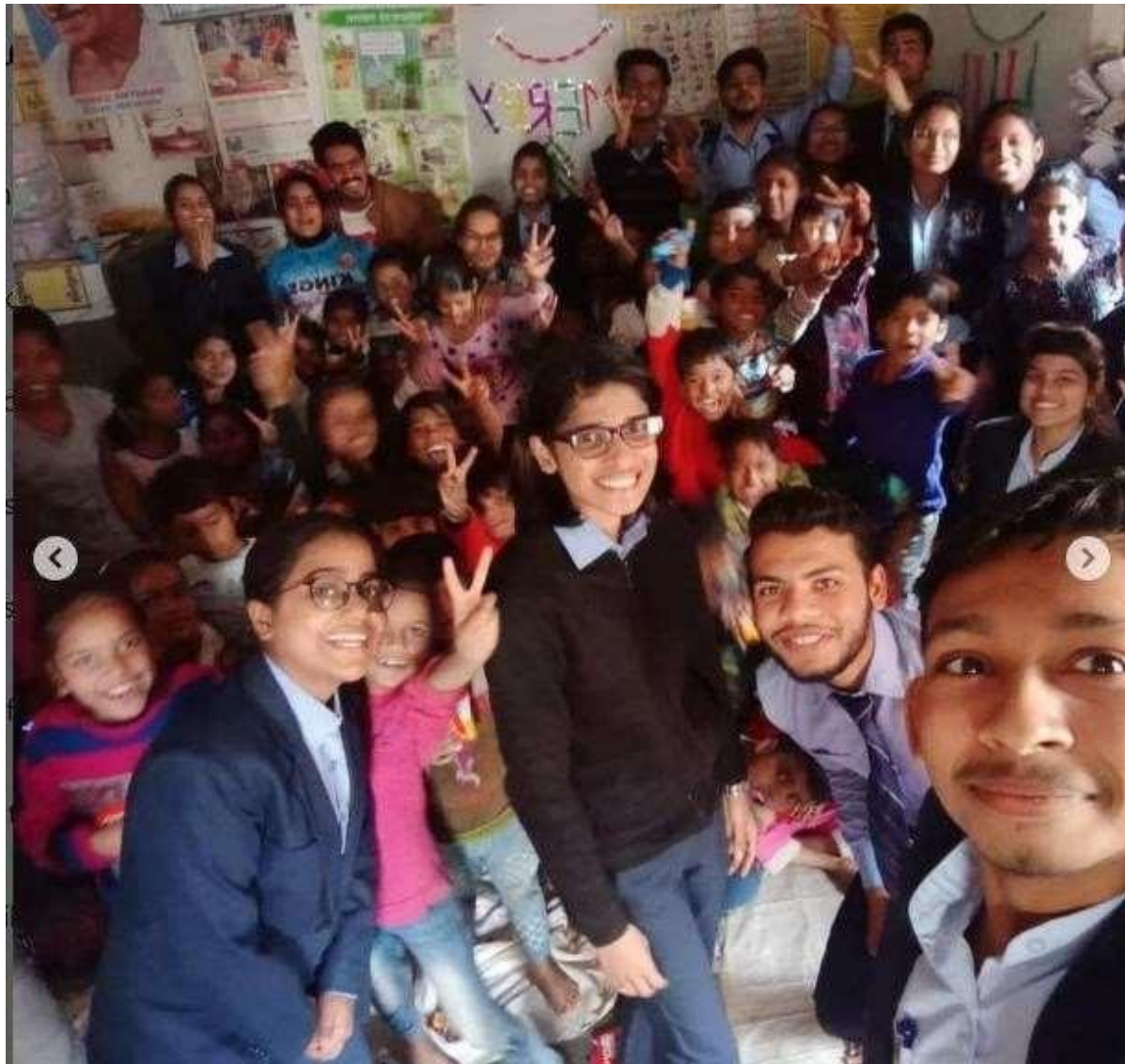
Glimpses of Aanganwadi and meeting with Kids