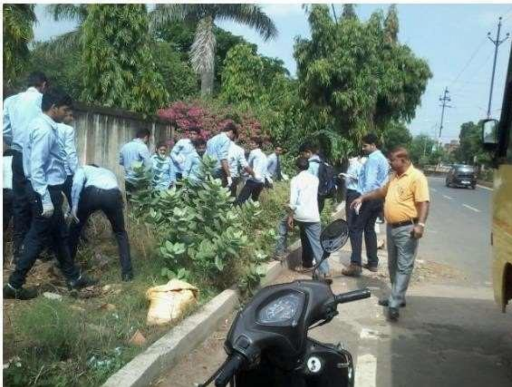
Glimpses of Swacch Bharat