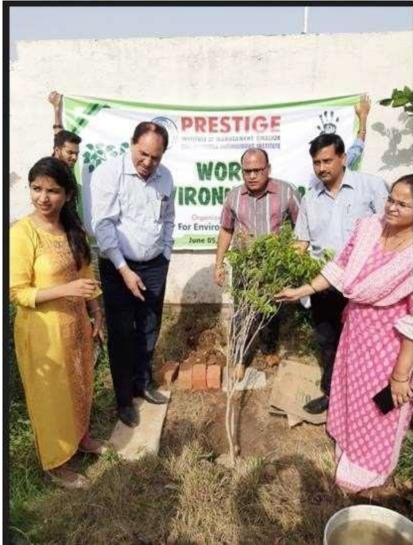
Glimpses of World Environmental Day