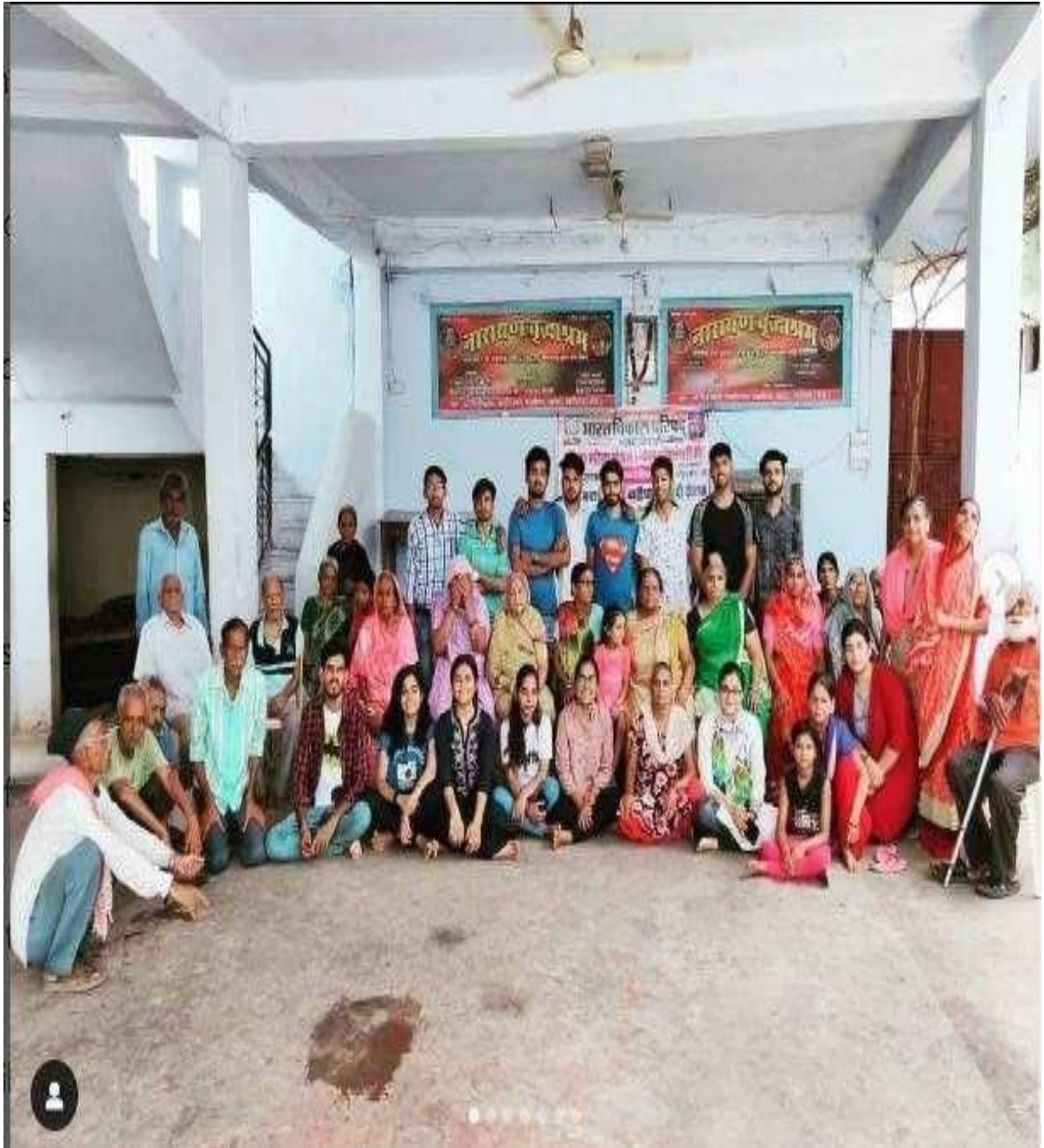
Glimpses of Khushi - Food Distribution at Narayan Old Age Home