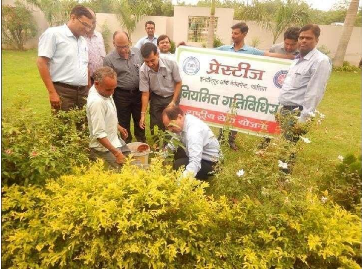
Glimpses of Plantation Activity