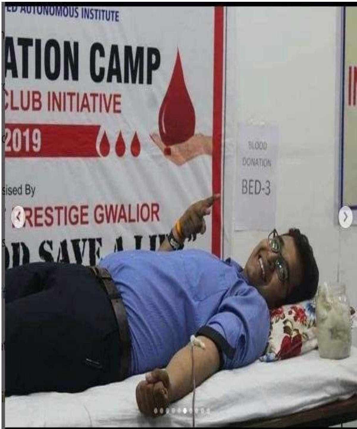
Glimpses of Blood Donation Camp