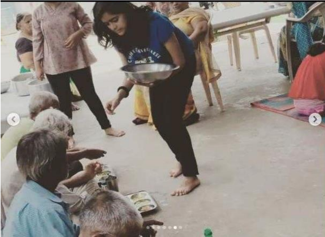
Glimpses of Khushi - Food Distribution at Narayan Old Age Home