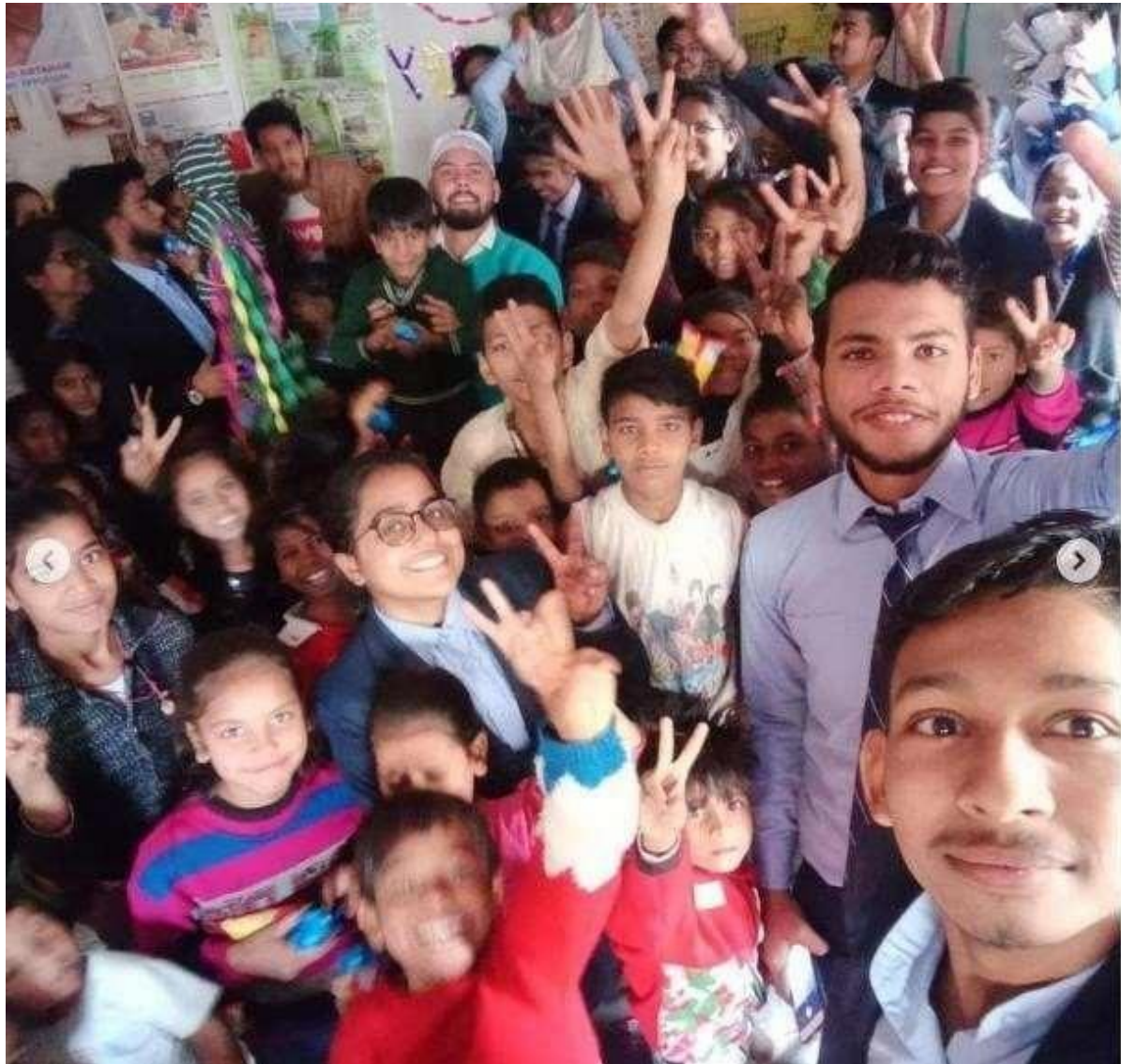
Glimpses of Aanganwadi and meeting with Kids