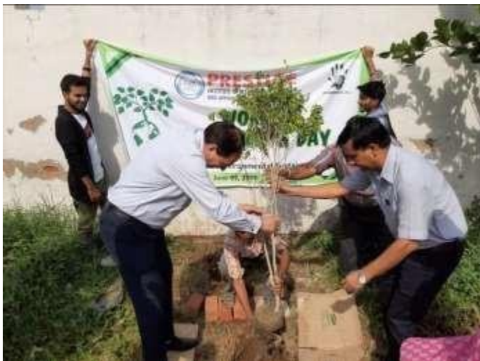
Glimpses of World Environmental Day