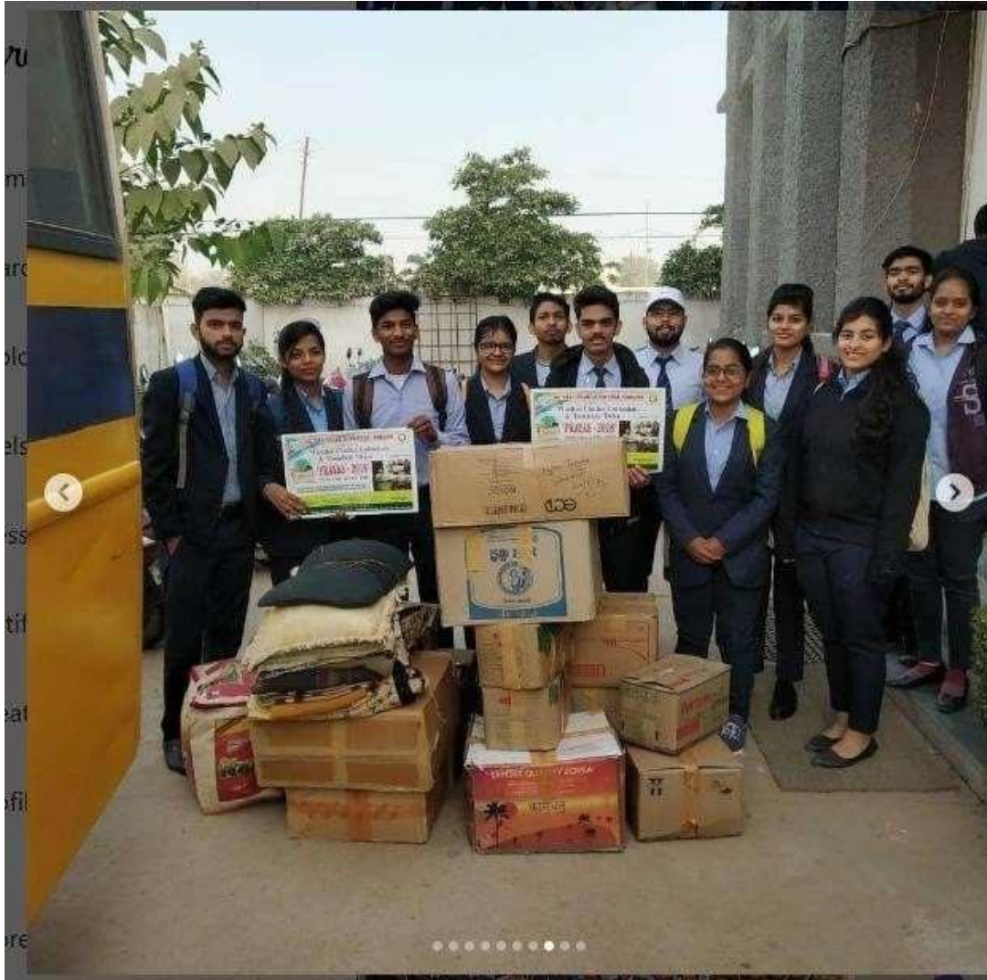
Glimpses of Prayas- 2018