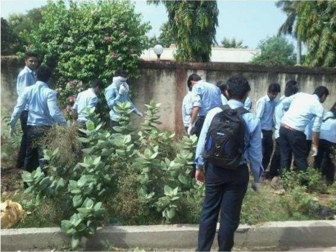
Glimpses of Swacch Bharat