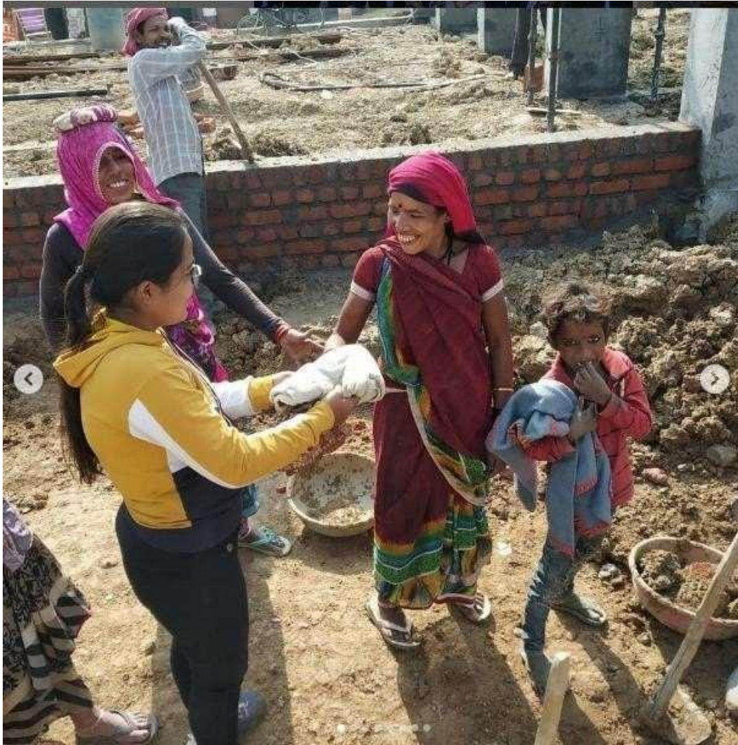
Glimpses of Prayas- 2018