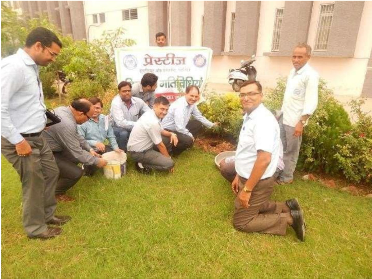
Glimpses of Plantation Activity