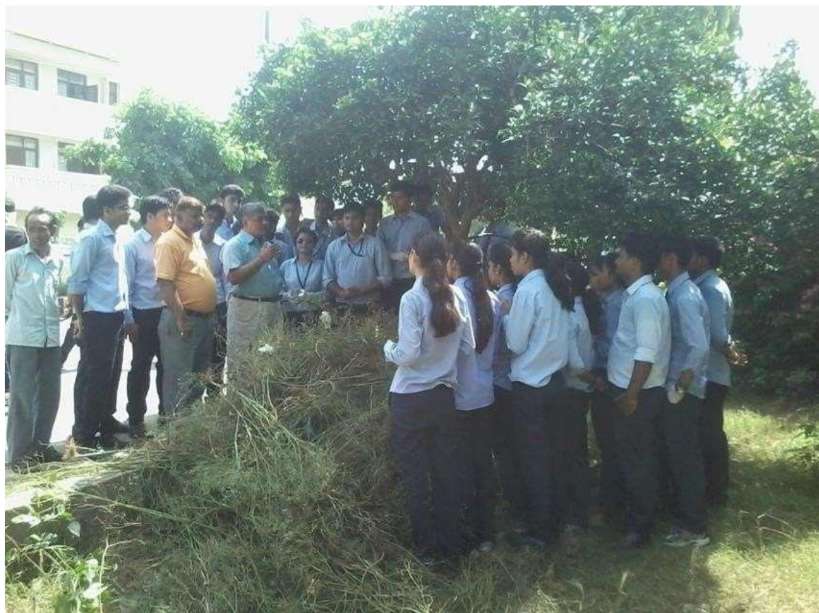
Glimpses of Hay Harvesting Carrots