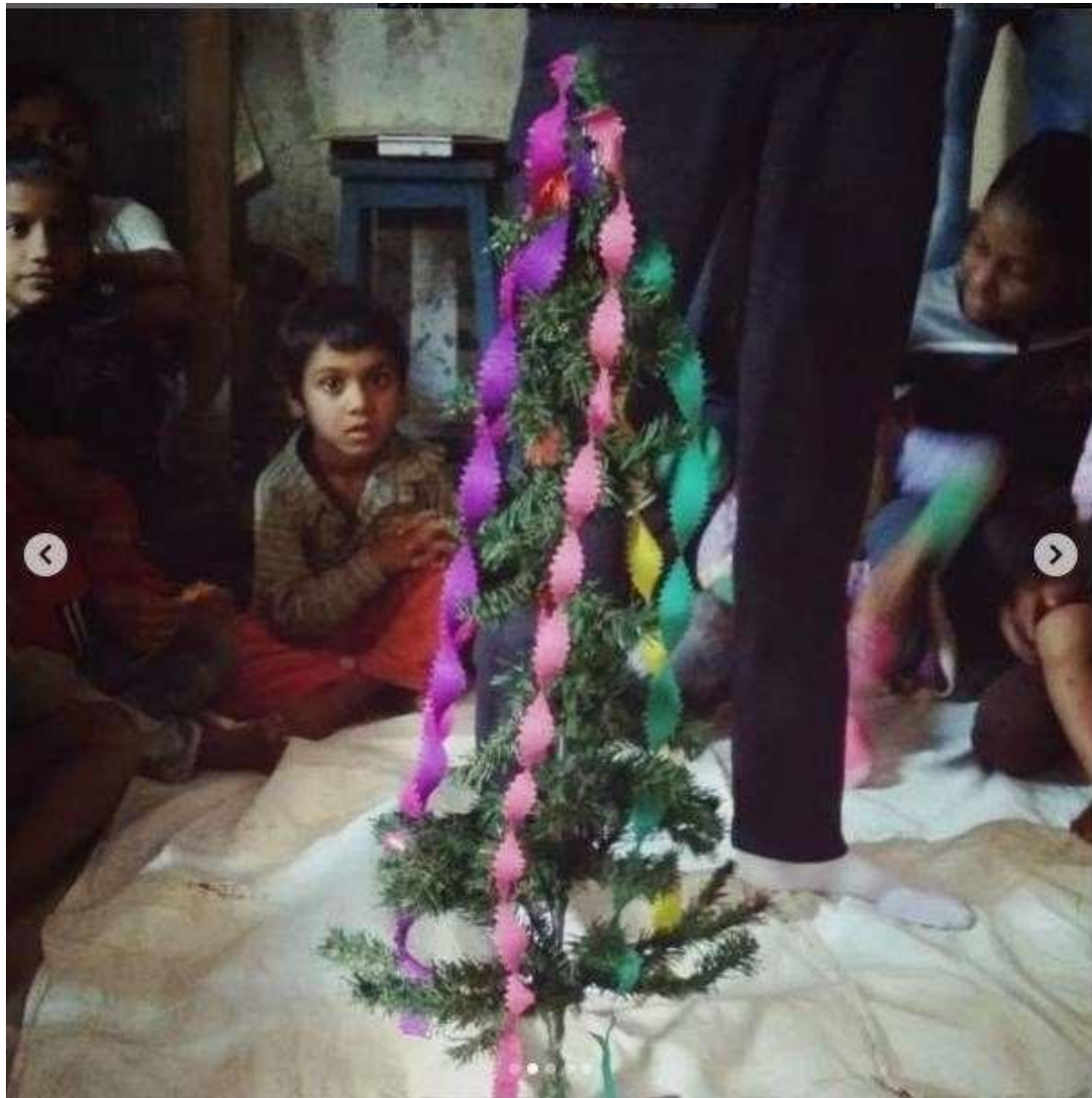
Glimpses of Aanganwadi and meeting with Kids