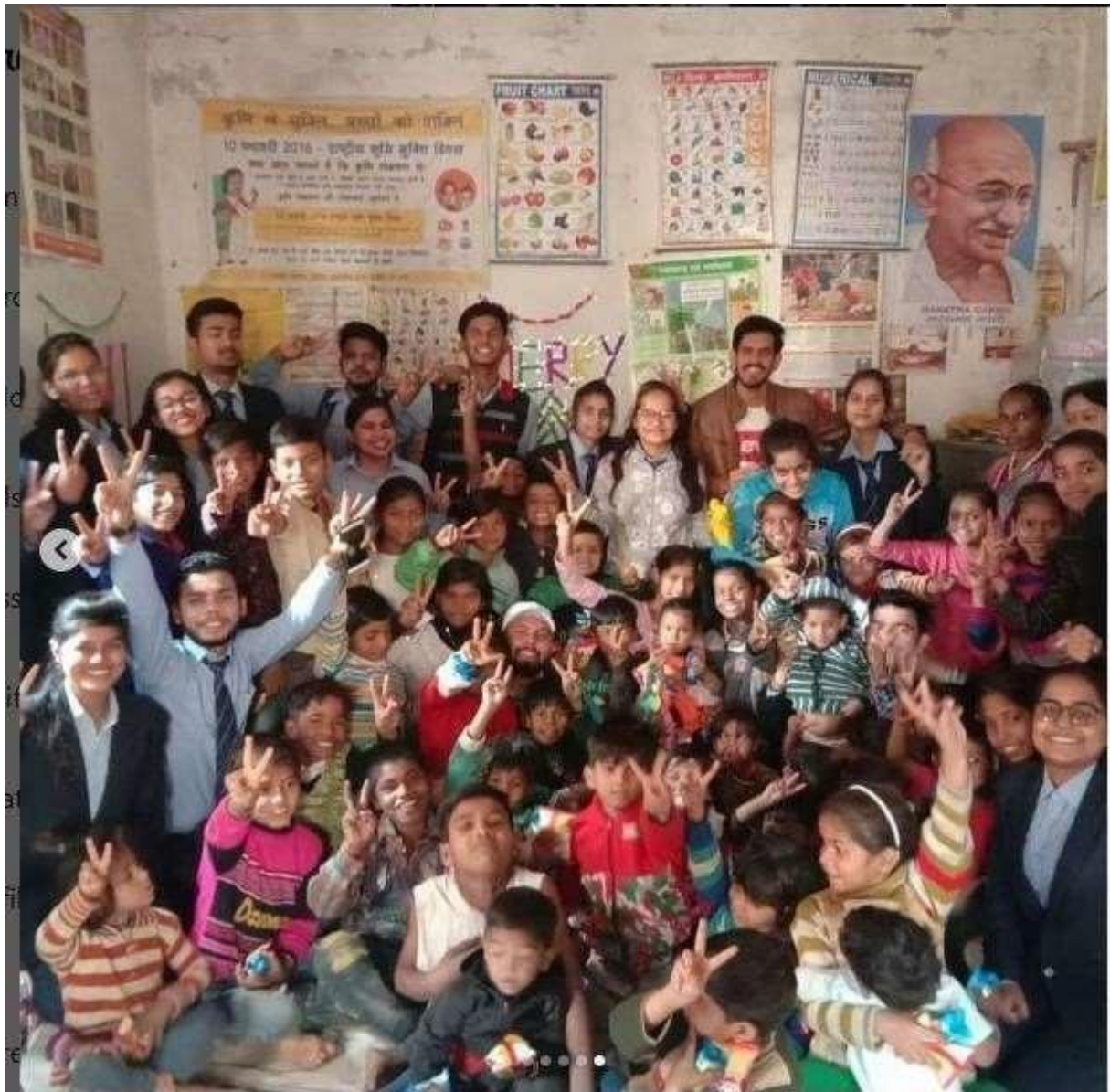
Glimpses of Aanganwadi and meeting with Kids