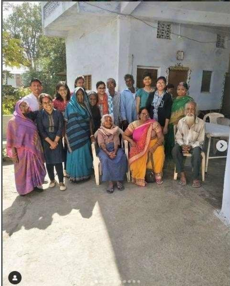
Glimpses of Narayan Old Age Home visit