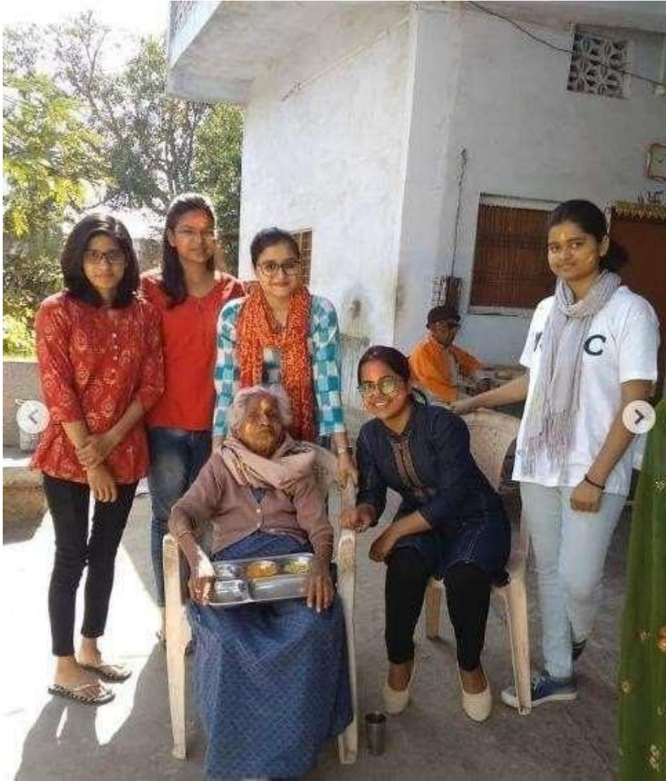
Glimpses of Narayan Old Age Home visit