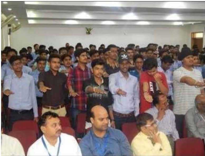
Glimpses of Matdata Jagrukta Abhiyaan